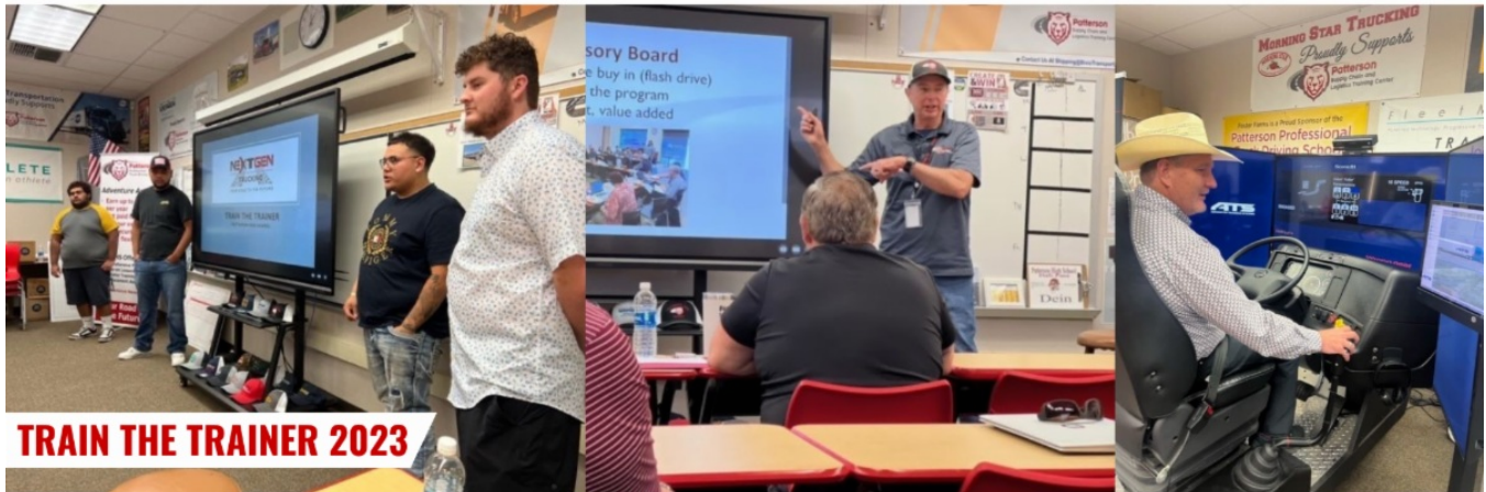
TRAIN THE TRAINER 2023