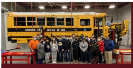
Mercer, Kentucky Trucking Association and Next Gen with a group of Diesel Tech students from a Louisville High School

At Mercer, we also understand the importance of educating our next generation on the many opportunities within our industry. We believe in the value of education and career development for these future transportation professionals. That is why we are proud to partner with the Next Generation in Trucking Association, in an effort to encourage students to become more familiar with the transportation industry and its growing opportunities.